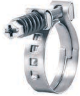
PG 178 for small diameters