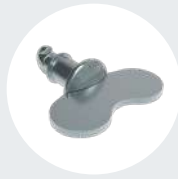
QUICK ACCESS FASTENERS