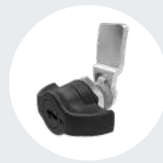
CAM LATCHES, LOCKS & SWING- HANDLES