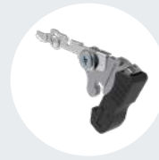
INJECT / EJECT